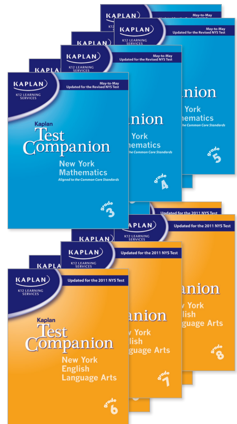
Kaplan Test Companion: New York State Test English-Language Arts / Mathematics (Grades 3-8)