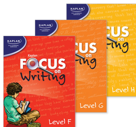
Kaplan Focus on Writing Levels F-H