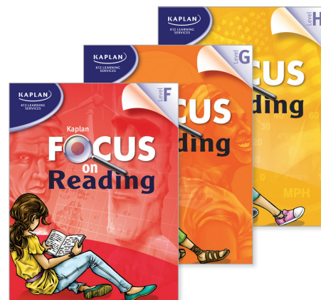
Kaplan Focus on Reading Levels F-H