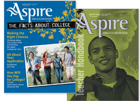
Kaplan Aspire Student and Teacher Editions