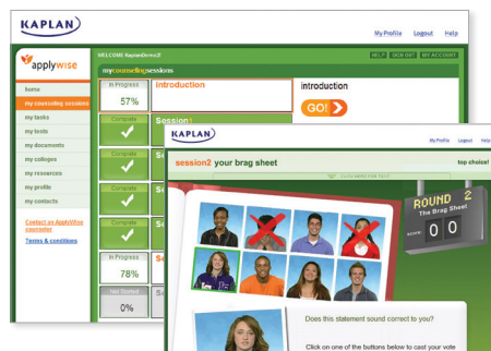
Interactive counseling sessions and games