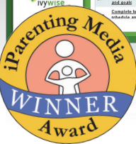
ApplyWise resources: Winner of iParenting Media Award